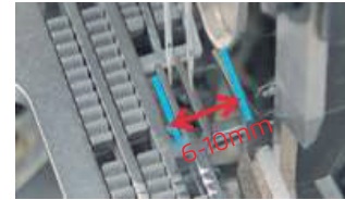
Available to narrow and wide edge