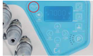
Voice guide; One key to reset