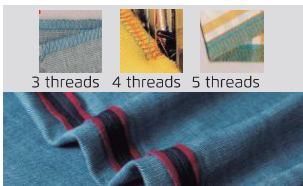
Suitable for light and heavy material

Super High Speed Power Saving Overlock Machine Power saving; Oil-proof