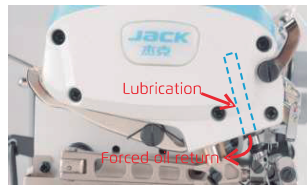
Oil-proof needle bar