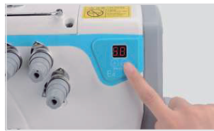
Easy to operate